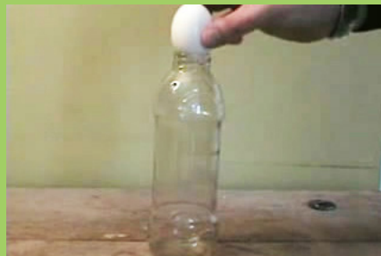
How the Humpty Dumpty fall into a bottle?