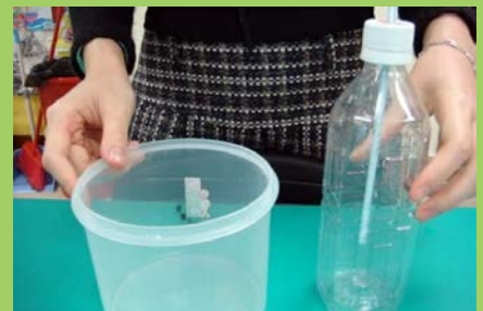
The magic straw