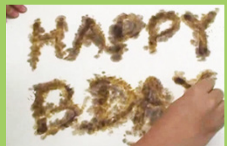
The Magic Solution