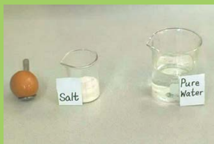
The Marvellous egg