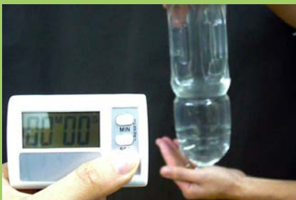
Hurricane in a bottle