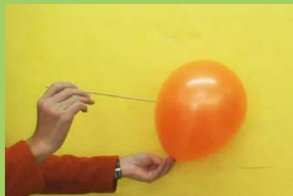
A non-explosible balloon