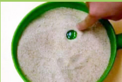
Turning a marble into a table-tennis ball