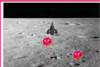
Yau Ging Kit