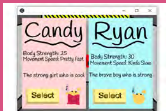
YamTin Ching Vulcan

Enhance students' interest in coding design by using different softwares. Form STEM coding design