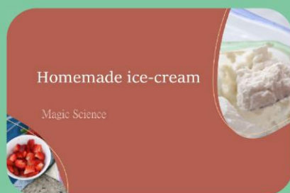
Homemade ice cream

The activity aims at arousing pupils' awareness and interests about the nature and developing their inquiry learning ability such as the ability to explore or to discover.