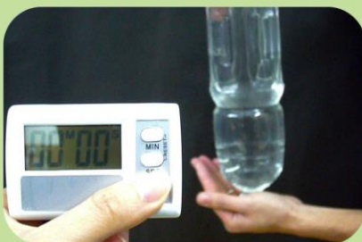
Hurricane in a bottle