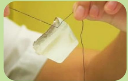
To "fish" the ice