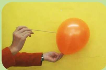
A non-explosible balloon