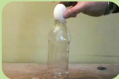
How the Humpty Dumpty fall into a bottle?