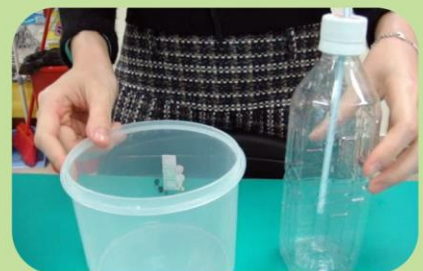
The magic straw