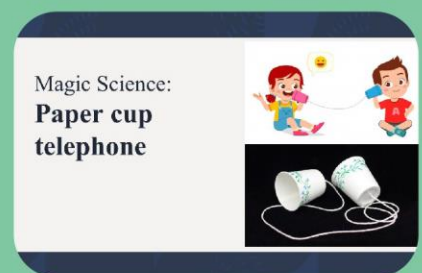
Paper cup telephone