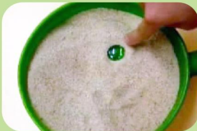
Turning a marble into a table-tennis ball