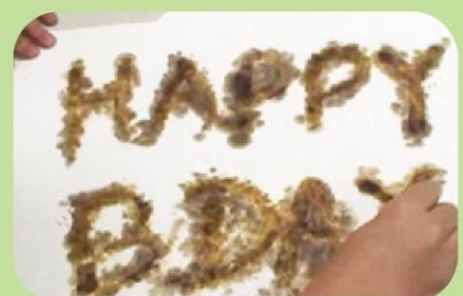
The Magic Solution