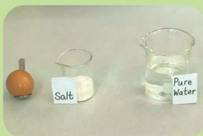
The Marvellous egg